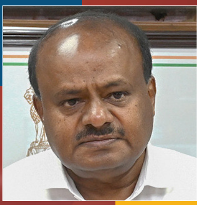
Shri H. D. Kumaraswamy Hon'ble Minister for Heavy Industries & Steel Government of India

Wednesday, 11 th February 2026 | Taj Palace, New Delhi 1000-2000 hrs (IST)